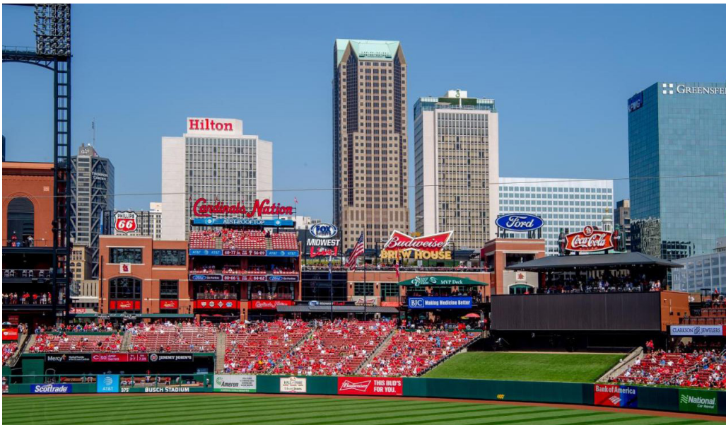
Hilton St. Louis at the Ballpark