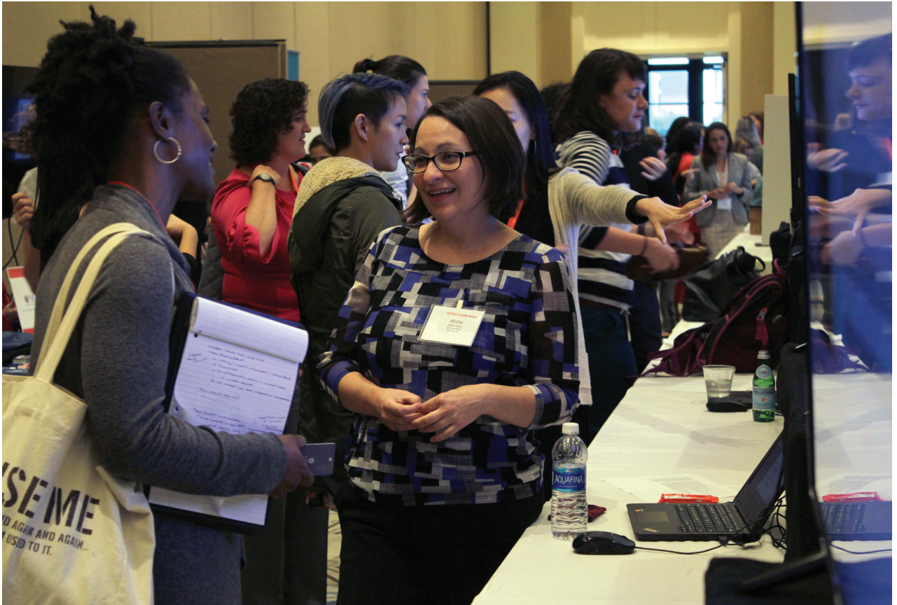
WSDS attendees present and network during a poster session.