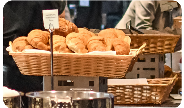
Attendee continental breakfast at CSP 2023, San Francisco, California