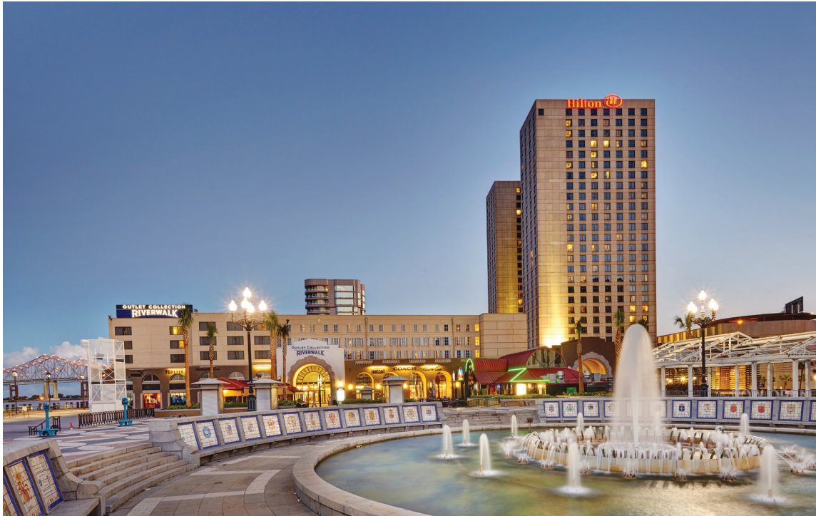
The Hilton New Orleans Riverside

A limited number of rooms are available at a negotiated group rate, if booked by January 12, 2019.