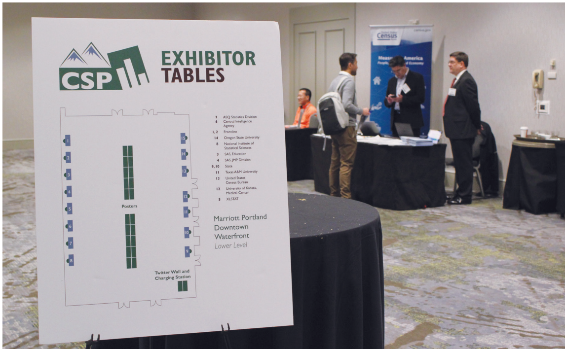
Exhibitors at the 2018 Conference on Statistical Practice

The ASA Conference on Statistical Practice is the ideal place to meet a talented group of statisticians and data scientists from business, industry, and academia.