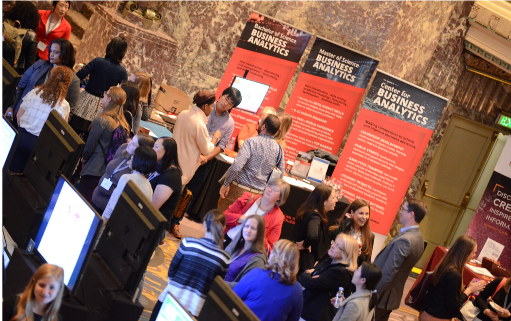
WSDS attendees network and mingle with exhibitors during a poster session.

The Conference for Women in Statistics and Data Science is the place to meet and support women working in these growing and vital fields.