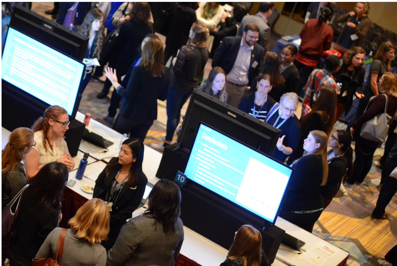
WSDS attendees present and network during a poster session.