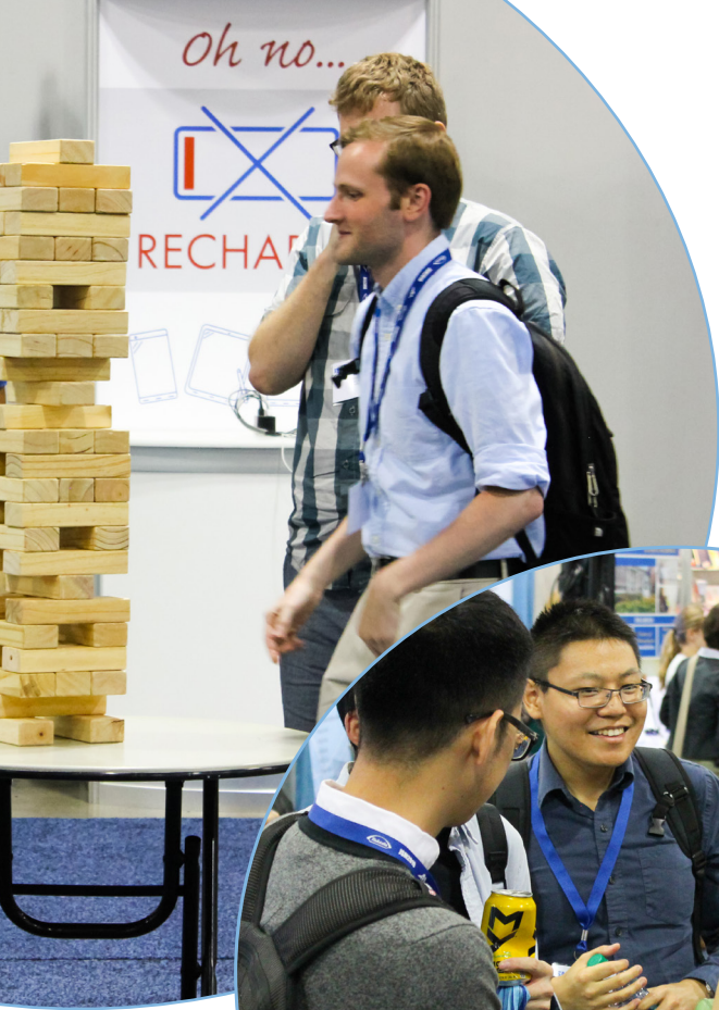
Attendees mingle during the 2019 JSM Opening Mixer in Colorado.