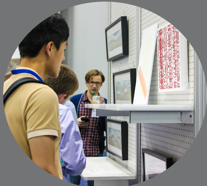
JSM attendees view exhibits at the 2019 Data Art Show.

In the JSM EXPO! Explore the relationship between data and art with this JSM exhibit featuring art made from data by your colleagues.