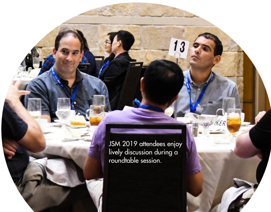
JSM 2019 attendees enjoy lively discussion during a roundtable session.

We will focus on modern survey disclosure limitation methods and the need for proper global disclosure risk measures and informed participation by survey stakeholders.