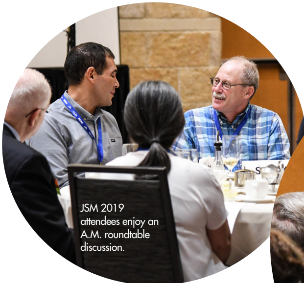
JSM 2019 attendees enjoy an A.M. roundtable discussion.

Join this roundtable to discuss transformative approaches to providing safer communities for both police and residents.