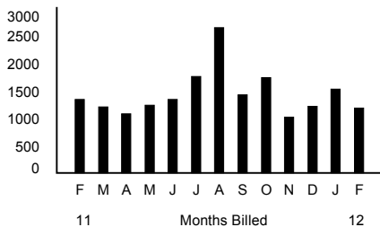
13-Month Usage (Total kWh)