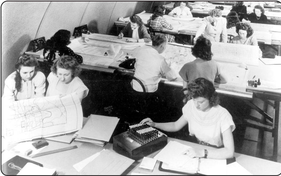
1947: Statistical Laboratory area-sampling operations in a temporary building at Iowa State College