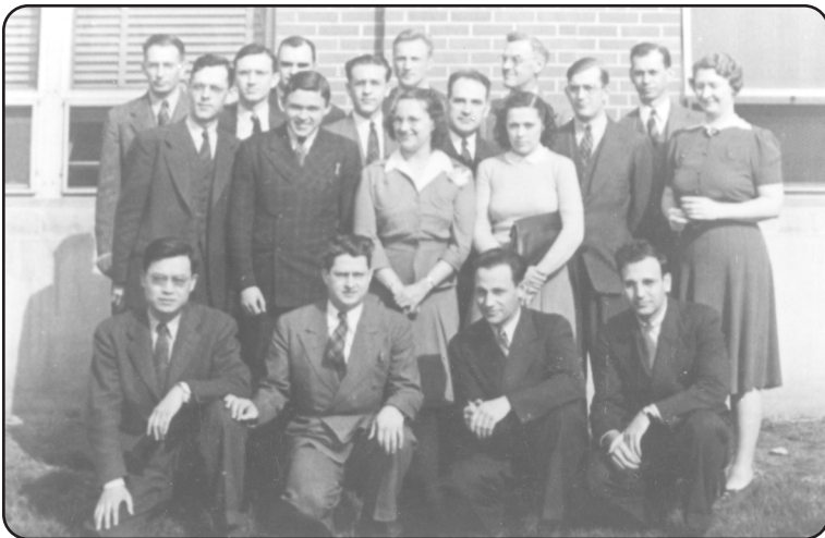
1941: Statistical Laboratory group at Iowa State. Snedecor is in the last row, fourth from the left.

Snedecor's enthusiasm for the profession encouraged its development. He believed that a basic introductory course in statistics for students with a major in natural and social sciences was essential. The course would provide training as part of the general education and foster an interest in statistics as a profession for young students. In 1947 he spoke at a meeting of the American Statistical Association, advocating a general statistics course. In 1939 he was named a Fellow of the ASA, and in 1948 he served as ASA President.