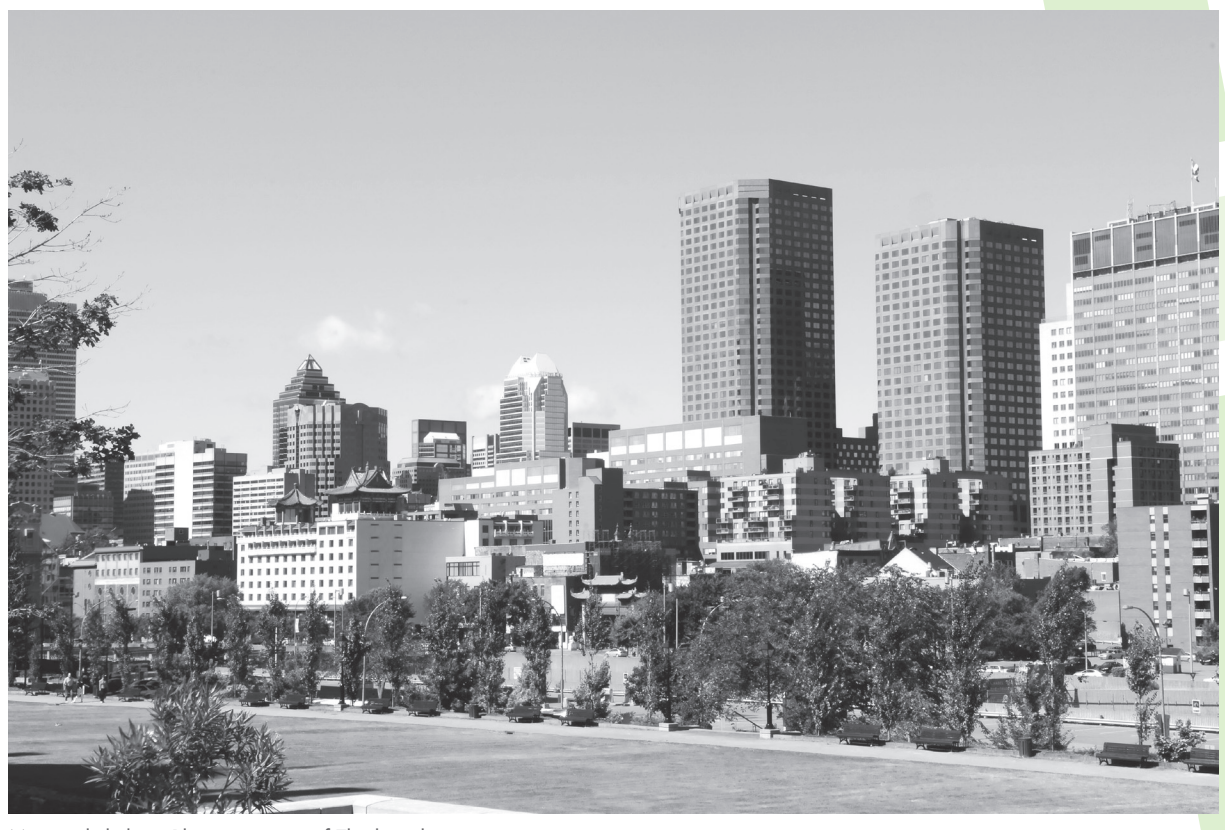
Montréal skyline.